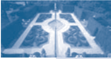
French parterre gardens at Hillwood Museum & Gardens

Custom tour of Washington, lunch and tour of Hillwood Museum $85/person