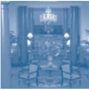
Capital Hilton Reception

Breakfast (Thursday, Friday and Saturday); Dinner (Thursday evening); Farewell Gala Dinner (Saturday Evening)