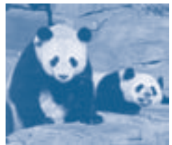
Pandas at the National Zoo were a gift from China