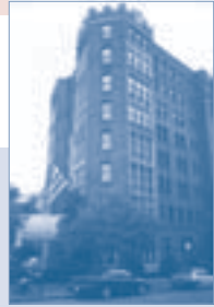
Henley Park Hotel