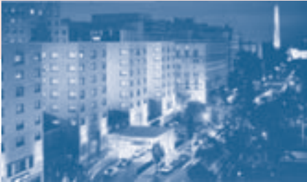
Capital Hilton Hotel