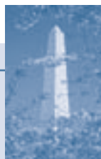
Washington Monument and the famous cherry blossoms, which were a gift from Japan in 1912