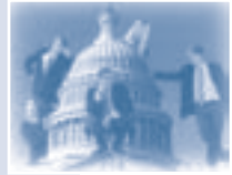
The Capitol Steps

The Capitol Steps is a troupe of current and former Congressional staffers who monitor all international events and personalities on Capitol Hill, the Oval Office and then take a humorous look at serious issues while providing laughs for millions... Log on to www.capsteps.com – download some of their latest, then sign up for a ticket to see the hottest show in Washington. Tickets to The Capitol Steps are $36 per ticket. Please sign up on the registration form for reserved tickets.