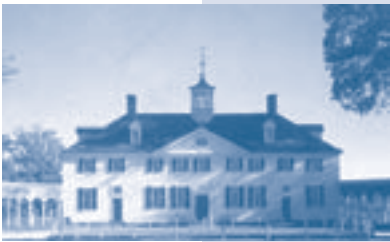
"To see George Washington, look in your wallet. To know him, come to Mount Vernon"

Continue on to Old Town Alexandria for lunch at the waterfront restaurant, Chart House, (lunch on own) and visit the Torpedo Factory Art Center (built in 1919 as a torpedo manufacturing plant) which is now a large visual arts center. Explore the 84 working studios, 8 group studios and 6 galleries. Log on to www.torpedofactory.com for complete information.