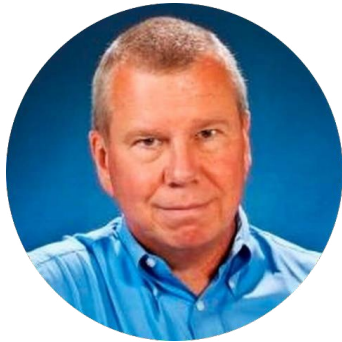
John Bollinger, CFA, CMT USA

Creator of Bollinger Band, one of the famous indicators.