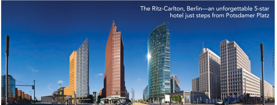
The Ritz-Carlton, Berlin—an unforgettable 5-star hotel just steps from Potsdamer Platz