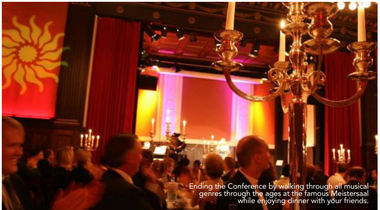
Ending the Conference by walking through all musical genres through the ages at the famous Meistersaal while enjoying dinner with your friends.