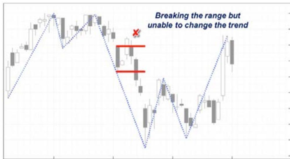
Figure 1: To avoid the Range Effect, they only take into account those patterns that affect the trend as expected.