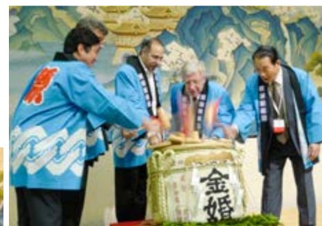
Figure 2: IFTA 2015 Tokyo Delegates